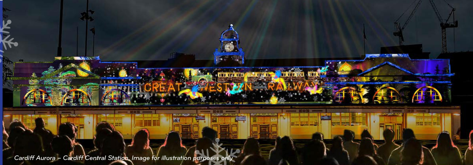
Cardiff Aurora - Cardiff Central Station. Image for illustration purposes only.

Commissioned by Cardiff Council and delivered by Floodlighting and Electrical.