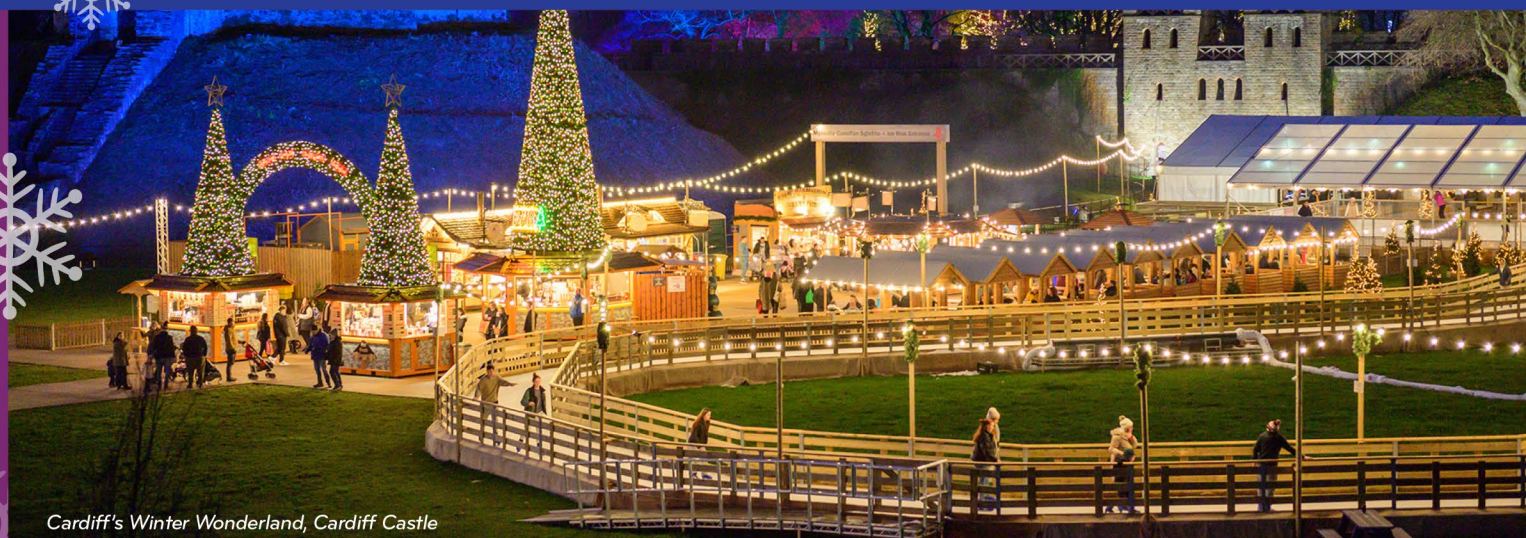
Cardiff's Winter Wonderland, Cardiff Castle

Curated by Craft*Folk, you will find original work from talented makers in every stall. Look out for bespoke jewellery, beautiful textiles, wooden turned gifts, and original artwork. Combined with a variety of seasonal food and drink, you can be sure to enjoy a vibrant festive atmosphere.